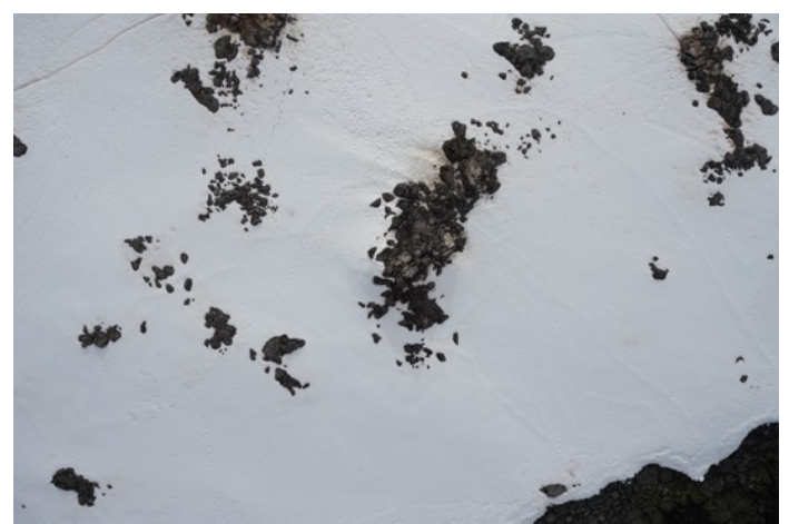
Aerial view taken by UAV of rock outcrops with fur seals