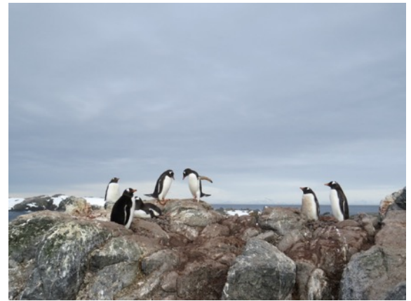
Gentoo Penguins near Hugo Island, photo by Anne Schaefer

During our first day on the LTER cruise, we successfully transited to and landed at Hugo Island, a penguin colony, and fur seal colony, site of interest. This site has become a clear example of how the northern WAP is transforming from a polar ecosystem to a more subpolar ecosystem, with subpolar species of penguins (Gentoo) and seals (fur seals) establishing themselves. Concerning the latter, last year was the first time fur seals were found breeding at this site. The closest known breeding colony of fur seals is nearly 400 miles to the north, making Hugo Island an important discovery and a unique opportunity to document a 'ground zero' change in the ecosystem here. During their time on shore, the LTER seabird component field team members (Megan Roberts and Anne Schaefer) conducted an extensive seabird and marine mammal census of one of the smaller islands here. This visit was about a month earlier than our previous visit during last year's LTER 18-01, on January 31. They once again found a fur seal pup, clear evidence that breeding is taking place. In addition, LTER marine mammal component field team members (Greg Larsen and Logan Pallin) conducted an unoccupied aerial vehicle (UAV, a.k.a. drone) survey of the island, documenting at high resolution seabird and mammal distribution relative to island topography and other features.